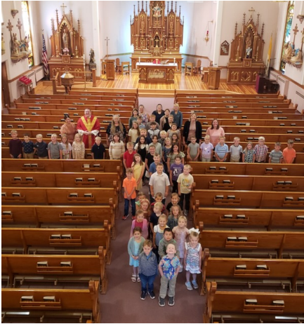
Left: The students and staff make the cross symbol in the church in Protivin.