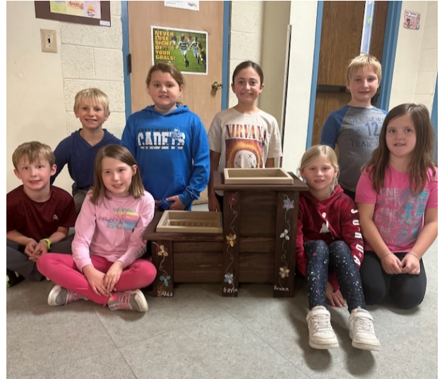
Above is the 3 rd Grade class with their 'Flowerprint' Flower Pot. Below is the 4 th Grade class pictured with their 'Bug' Flower Pot.