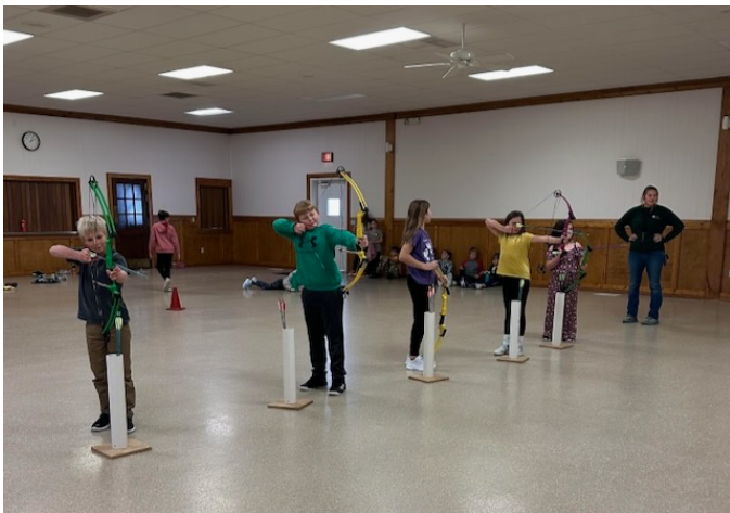
The 3 rd thru 6 th Graders enjoyed a unit on archery at the community center sponsored by Lake Meyer – Winneshiek County Conservation.

The Wax Museum Project is where students research one historical figure from history. The students read about the person, researched the person, and filled out a note's organizer, wrote an informative essay, and presented a speech to the class. They worked very hard on this. Thank you to all the parents and grandparents that came to visit the 'Wax Museum'.