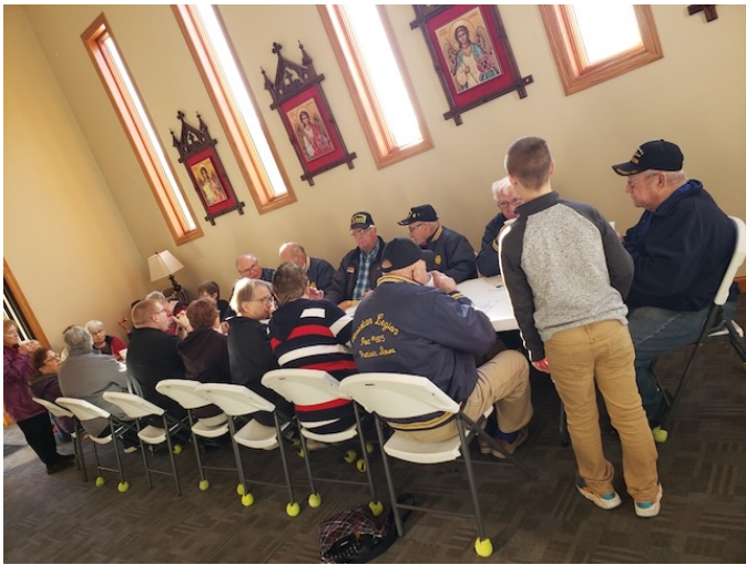
Pictured are the 6 th graders visiting with the Veteran's after our Veterans Day Mass.