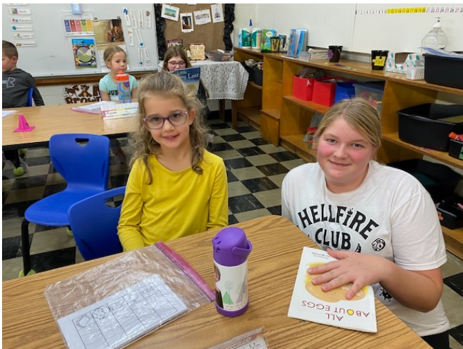
Enjoying time with our reading buddies, kindergarten and 1 st grade with 5 th & 6 th grade. What a fun activity reading with our friends!

3rd and 4th graders are learning about fossils. Today students were able to explore fossils from our area. They used observations to match fossils with their scientific names.